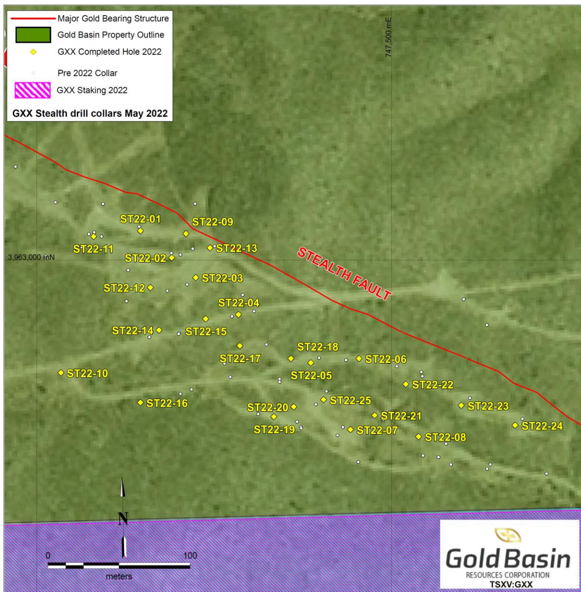
Map 2: Drill hole collar names and locations at Stealth Deposit 2022 Program